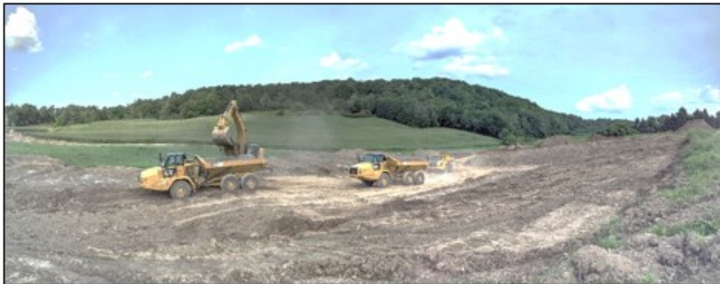
Figure 3. Thousands of yards of soil being removed to obtain rough storage bottom elevation.