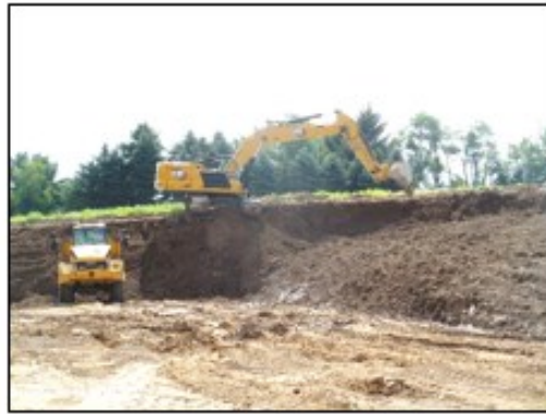
Figure 2. Large elevation change was required.