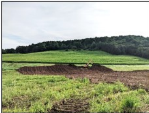
Figure 1. Topsoil being stripped from the area.

The Herkimer County Soil and Water Conservation district and a Town of Litchfield farm were awarded funds in 2018 through CAFO Waste Storage and Transfer Program Round 2 for a new concrete waste storage structure. The new structure holding 5.2 million gallons will bring the farm's total storage capacity to over 6 months. This is a requirement to be compliant with their SPEDES permit and allow proper timing, rate, and placement of manure optimizing the available nutrients.