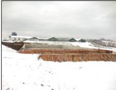
Figure 5. Walls are poured and grading has started.