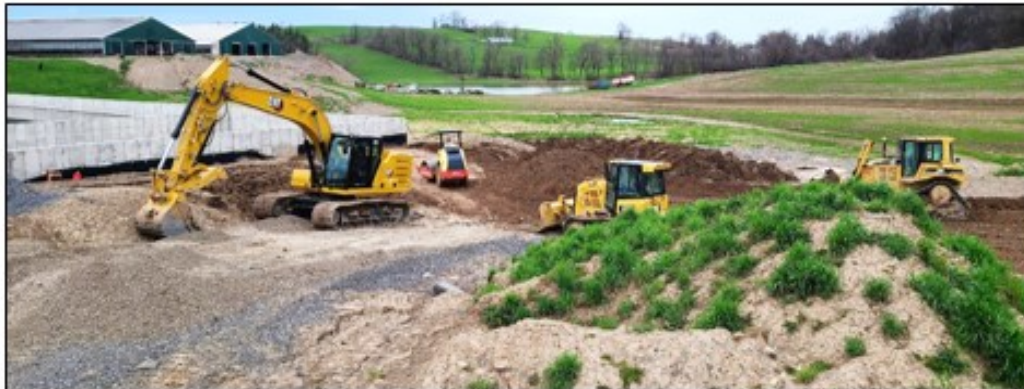
Figure 7. Backfilling resumed in May of 2022 after the winter.