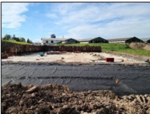
Figure 4. A geologic investigation is required for any new waste storage structure project under the CAFO Waste Storage and Transfer Program. The investigation revealed that bedrock was encountered increasing the risk of impacting groundwater resources. A synthetic liner was placed under the footprint of the storage.