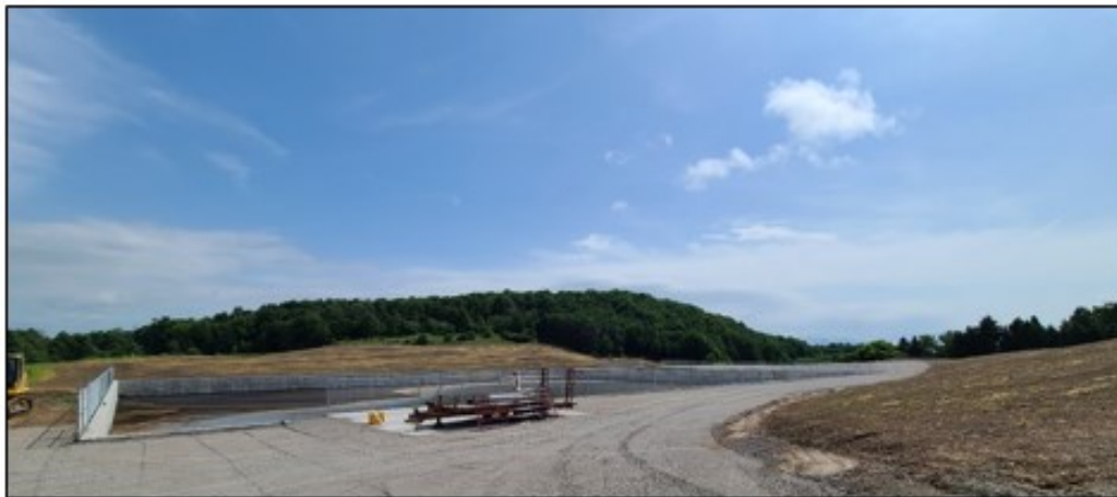
Figure 8. Project was completed and fully functioning in June.