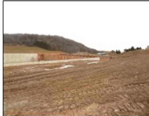
Figure 6. Concrete forms are being removed.